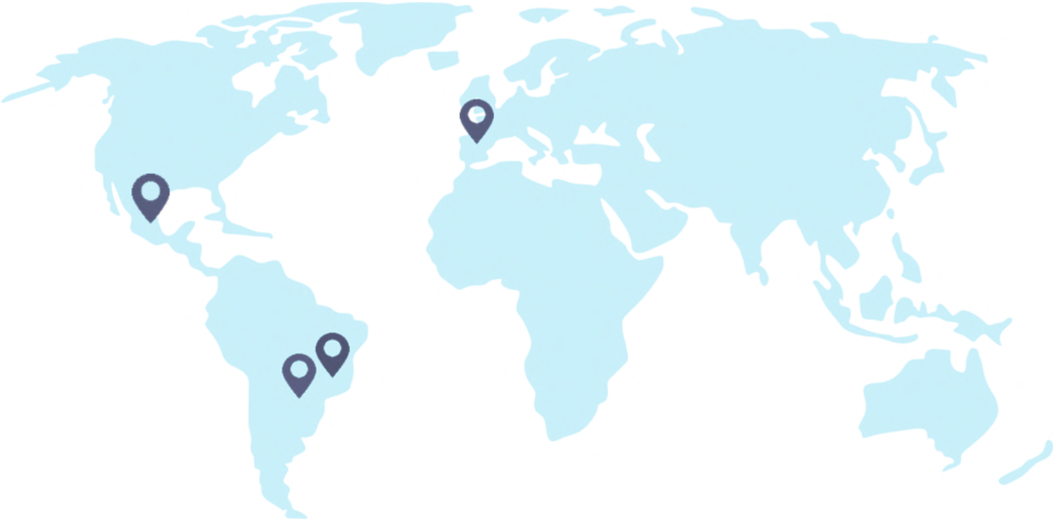
Operations in Europe and Latin America.